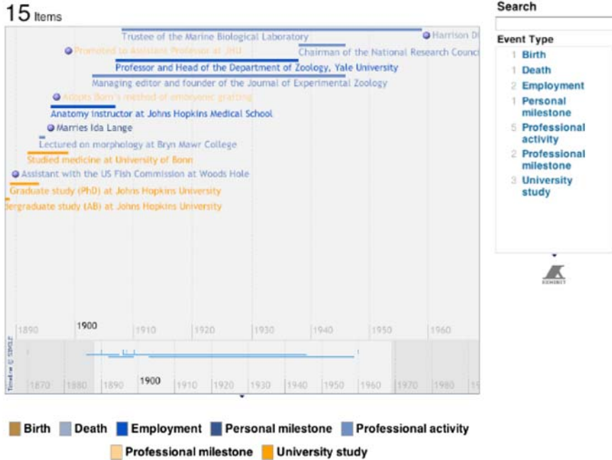
Figure 4. A timeline generated from material stored in our database related to Ross Harrison's career. As more materials are added, the timeline can be populated with these events.

they would not have thought to ask about. Our tools and applications are designed to aid researchers in finding new and unexpected connections, in our case related to embryo research. For example, embryologists rarely know how to carry out legal research, and yet they might well want to know what the regulatory climate is before they set up a stem cell research unit. Or American historians might be interested in learning about the rich history of embryo research to include a unit alongside discussions of genetics and evolution as important biological contributions. Historians of technology might start with an interest in microscopes and move to understanding of the concepts associated with those technologies. All these various researchers can query the database and not only find “hits” as in a traditional Google search, but also find relationships and links that are scholarly verified.